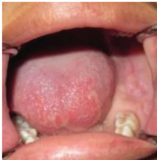
Figure 2 Intraoral view

tooth 75, and the color of the surrounding mucosa appeared to be similar to the one without ulcers. On palpation, we found that the mass had hard consistency, was localized with uneven surface, had an unclear edge of mass, appeared non-tender and was immobile.