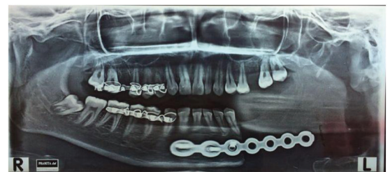
Figure 5 Panoramic radiograph 3 months post-surgery