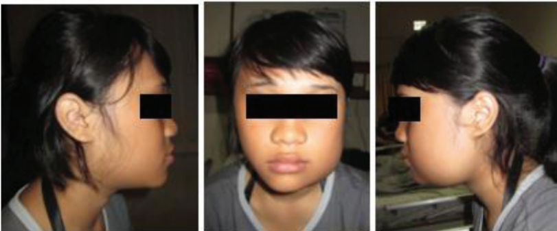
Figure 1 Profile preview before surgery