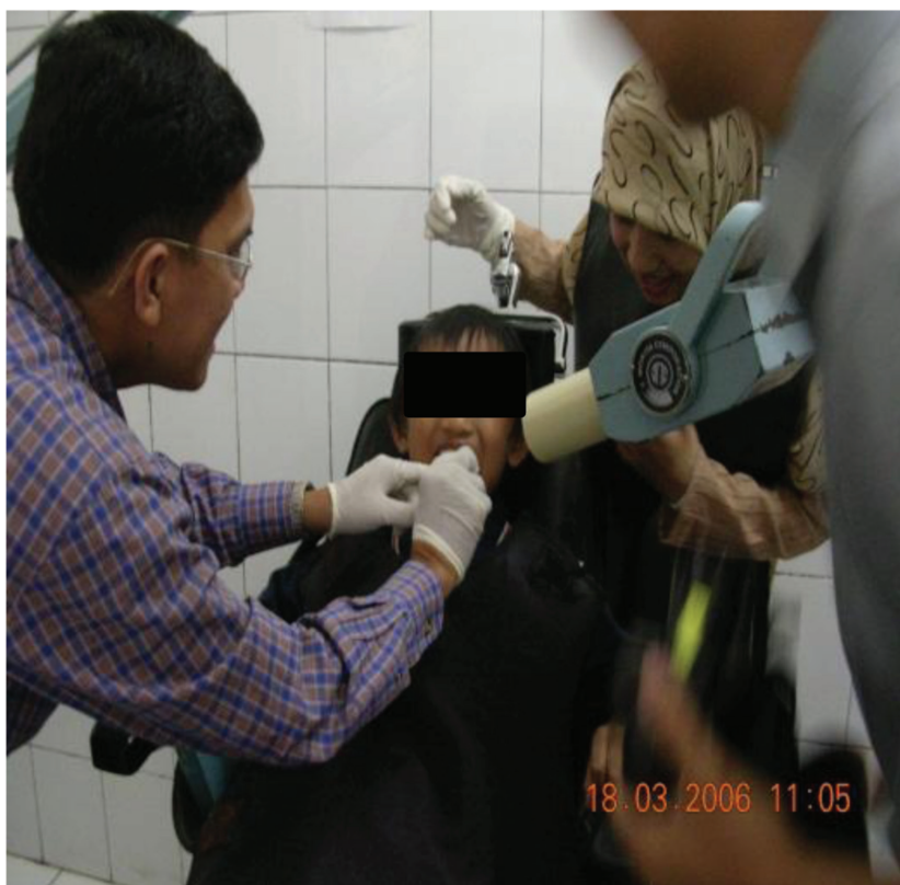
Figure 1 Patient during film placement